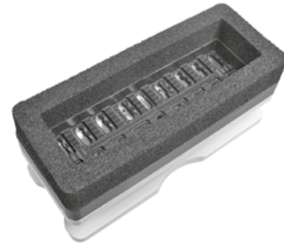
View of the suction chamber